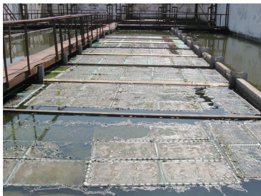
Fig. 3. 76 rafts with fiber carrier "VIYA" installed in the experimental section of the sewage treatment plant of Motor Sich JSC in 2017

tensively oxidized and decomposed by immobilized aerobic microorganisms. A large number of microorganisms-destroyers of oil products, formed through the process of immobilization, efficiently use wastewater oil products as a source of energy and carbon. Therefore, the "rafts" with a fibrous support, which are located at the beginning of the experimental section, are not silted with oil, and the mineral substances formed after the decomposition of hydrocarbons gradually settle at the bottom of the treatment plant.