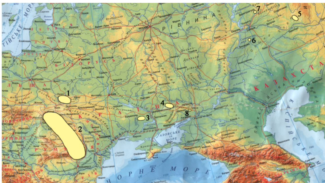
Fig. 1. Areas of copper and polymetallic ore occurrences on the territory of Eastern Europe, developed in the Eneolithic-Bronze Age:

On Nagolnyi i ridge known lead-zinc (Esaulovske, Nagolno-Tarasivske, Central Nagolchanske, Lower-Nagolchanske, South Esaulovske, Hrekivske, Diakovo), silver-base metal (Zhuravske, Berezoyske, Semenov Hillock, South Vyshnevske), gold-polymetallic (Bobrikovsky, Ostrobugorske) deposits and occurrences (Stepanov, 1977; Zhulid, 1985). These objects are of vein type and are mainly presented by steeply dipping veins of small and medium depths. The main ore minerals of the Nagolno-Tarasivske field are galena PbS, sphalerite ZnS, pyrite FeS 2 , arsenopyrite FeAsS, tetrahedrite (Cu, Ag) 10 (Zn, Fe) 2 Sb 4 S 13 . On the site of Semenov mound, the finds of silver nuggets are known. At the Zhuravske deposit, the bulk of silver is localized in galena (up to the first kilogram per ton) and in tetrahedrite (up to 10 kg/t). The main copper minerals are tetrahedrite, Cu 5 FeS 4 bournonite and CuFeS 2 chalcopyrite; lead – galena and tetrahedrite; zinc – sphalerite; arsenic – arsenopyrite. The latter is the most common ore mineral of the Nagolno-Tarasivske deposit (Gursky, Yesipchuk, Kalinin, Kulish and others, 2005).